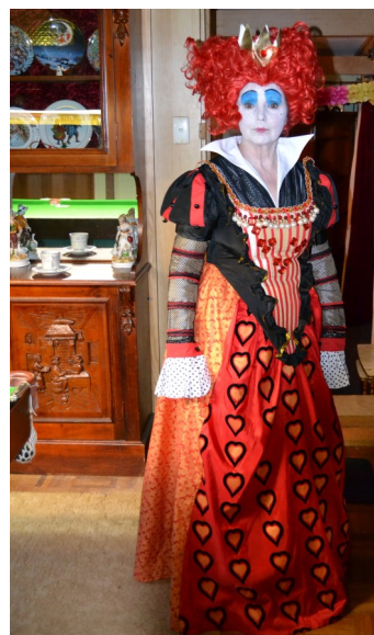
Queen of Hearts 2012