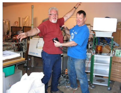
DIK October 2010

In the light of the Covid 19 Virus I have made a playlist of songs relating to it. I have named it Rockin' Pneumonia (which is pretty hard to spell). There are 26 songs in an Apple playlist. My challenge to the Club is to find more songs that they think could be added. Some songs are title related only, others are directly related (eg U can't Touch This, Don't Stand So Close to Me).