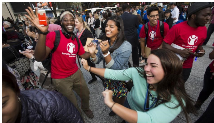
Participants in the Under One Sky event in Chicago on 24 September dance along to music performed by Funkadesi.

Under One Sky Chicago was one of more than 40 such events planned in the United States and more than 150 around the world. Other cities that hosted them include Sydney, New Delhi, Johannesburg, São Paulo, and New York.